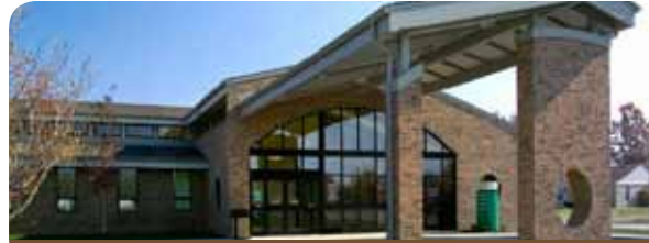
Vanan ENT & Sinus Center