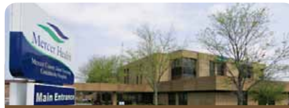
Mercer County Community Hospital